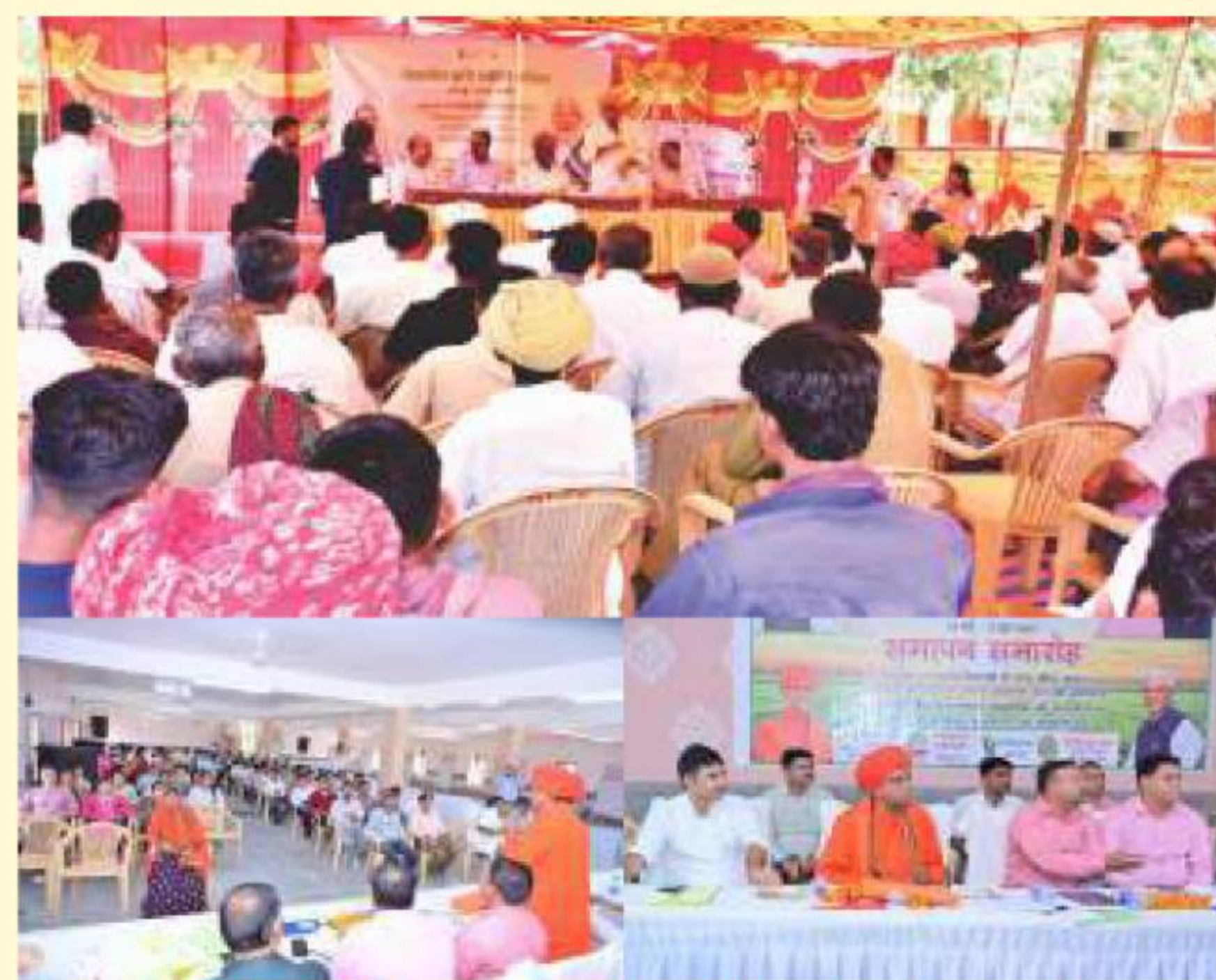
SKRAU, Bikaner Scientists addressing farmers in Vikshit Krishi Sankalp Abhiyan-2025