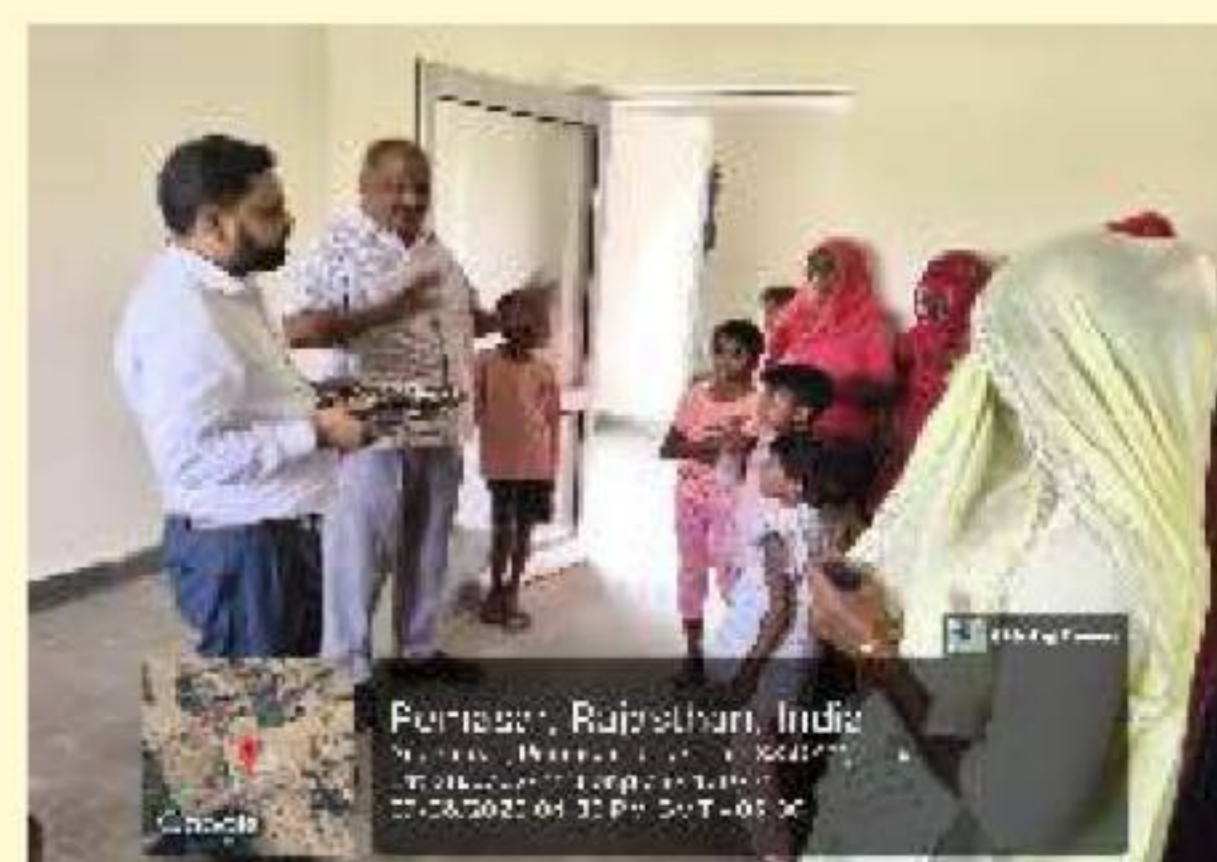
Mushroom Production and Value Addition Training