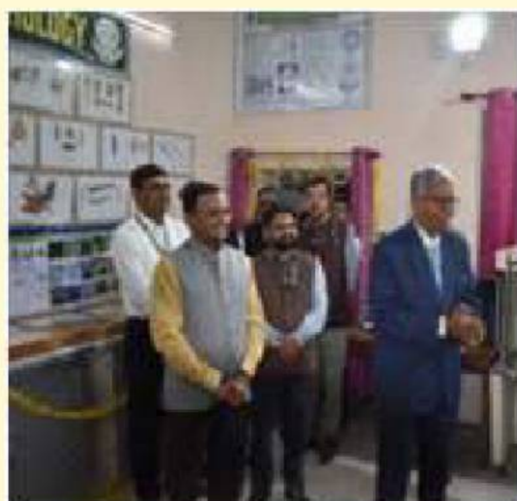
Inauguration of Plant Pathology Museum