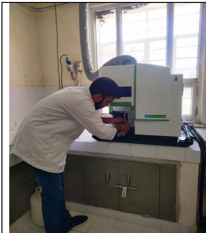
Inductively Coupled Argon Plasma