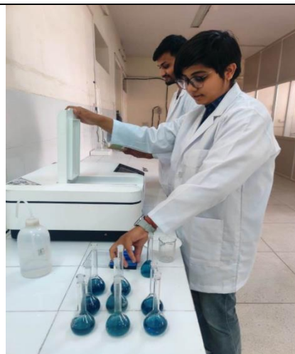
Multi Wavelength Spectrophotometer