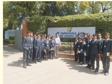
Students of IABM during their industrial visit to PI Industries, Udaipur