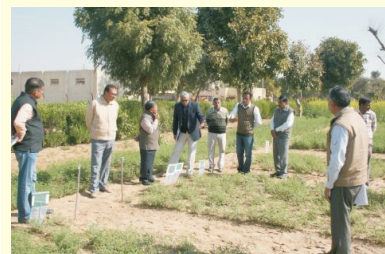
Visit of Hon'ble Vice Chancellor, SKRAU along with Director Research at experimental fields of ARS Bikaner