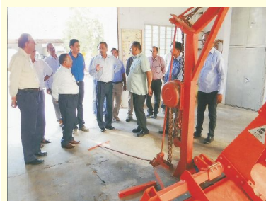
University dignitaries along with DDG (Edn.) during his visit to FIMTTC, Central Workshop, SKRAU, Bikaner