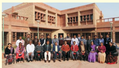
Participants of Winter School with Hon'ble VC, SKRAU and staff of DHRD