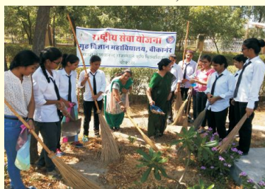
Swachh Bharat Abhiyan at College of Home Science