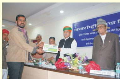
Shri Arjun Ram Meghwal, MP, Bikaner presenting Soil Health Card to a farmer during celebration of International Soil Day