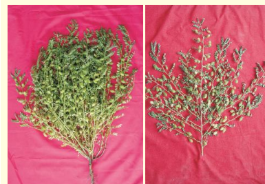
GNG 2171 (Meera) GNG 2144 (Teej)

GNG 2144 (Teej): This desi type chickpea variety developed from the cross CSJD 901 x CSG 8962 is suitable for late sown irrigated conditions of NWPZ. Its average yield is 2281 kg/ha. It is tolerant to fusarium wilt disease. 100 seed weight of this variety is 15.9 gm. It has been identified for Punjab, Haryana, Delhi, Northern Rajasthan and Uttarakhand.